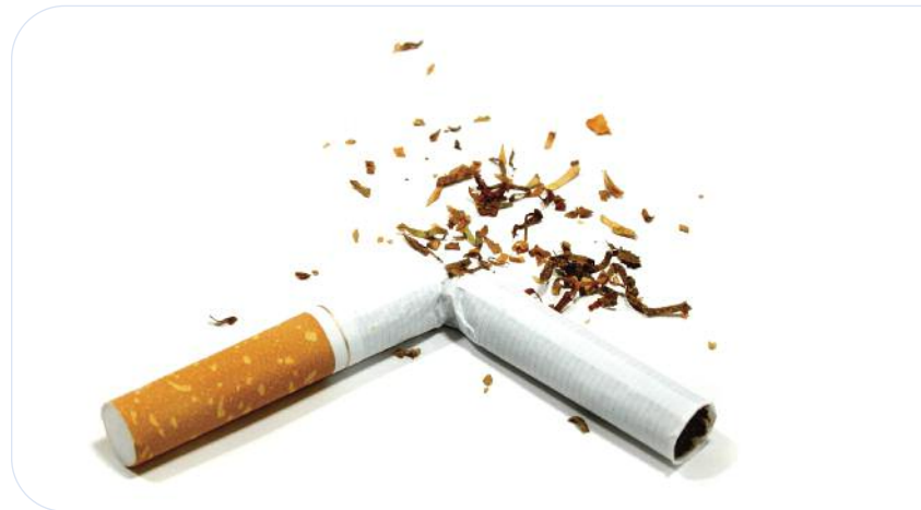
Modified from source: New York City Department of Health and Mental Hygiene. Health E-News. January 22, 2007.